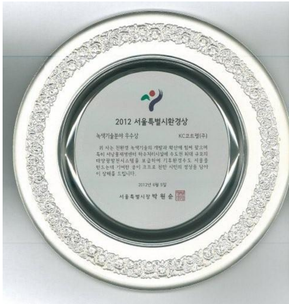
Awarded by the City of Seoul, June 5th, 2012