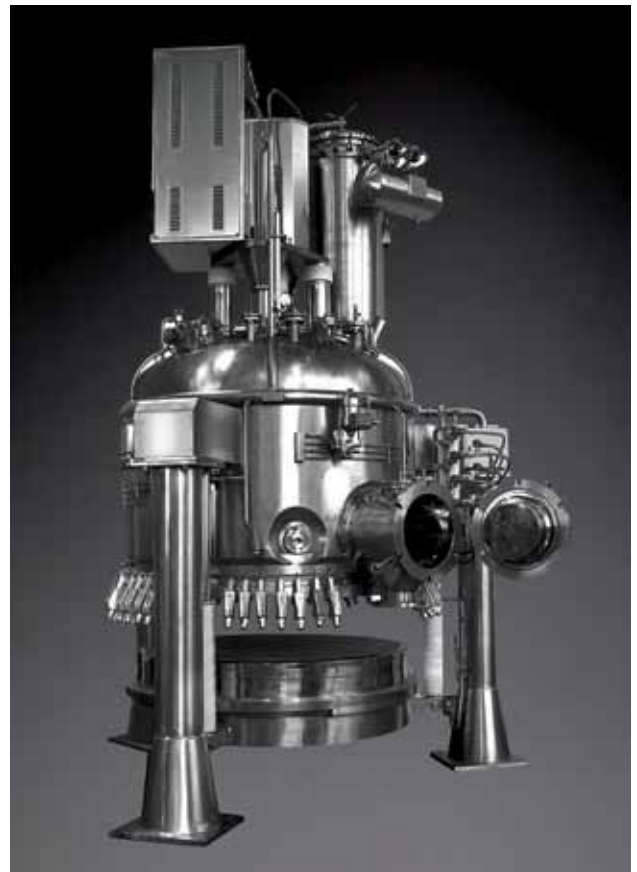
Drying filter