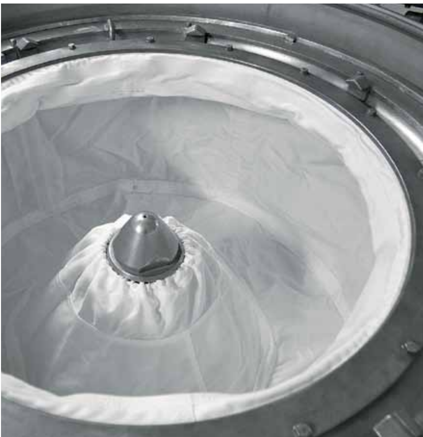
Centrifuge bag - courtesy of Bioindustria L.I.M.