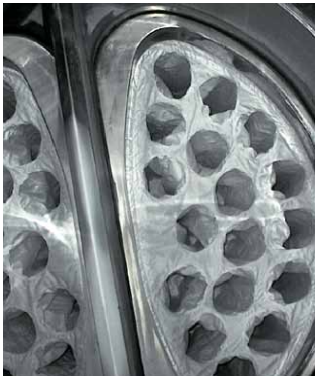
Octopus on jet mill